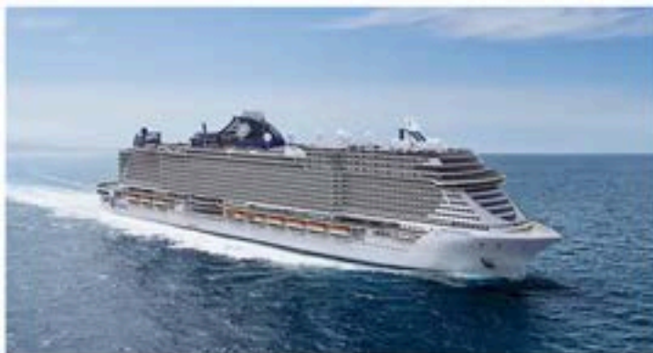
MSC Seashore Ship

Thursday to Sunday 3 to 6 December 2026 Destination Nassau and Ocean Cay Marine Reserve