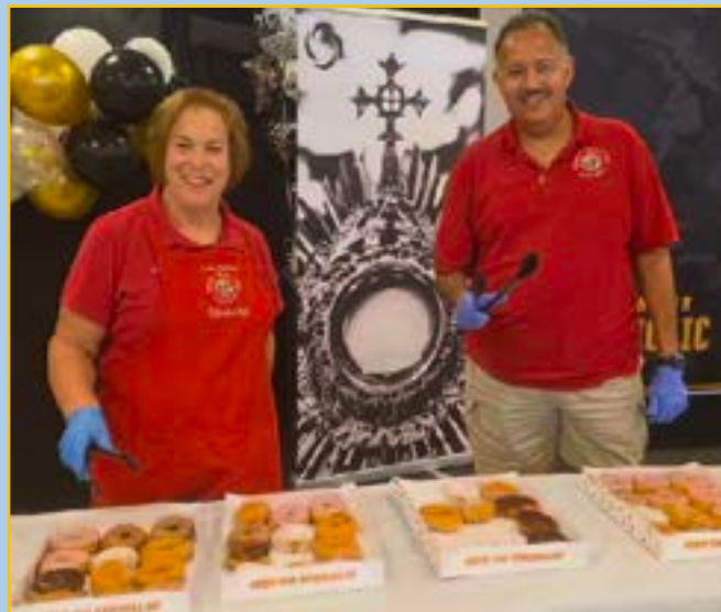
Donut Hall Duty