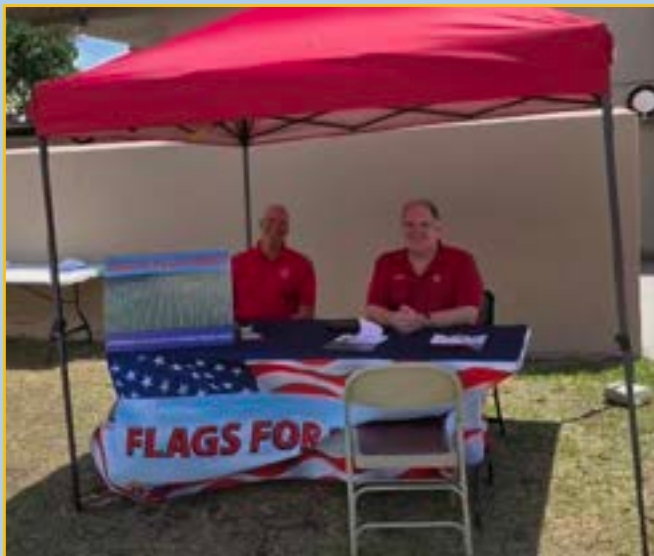
Flags for Heroes Sponsorship Sales